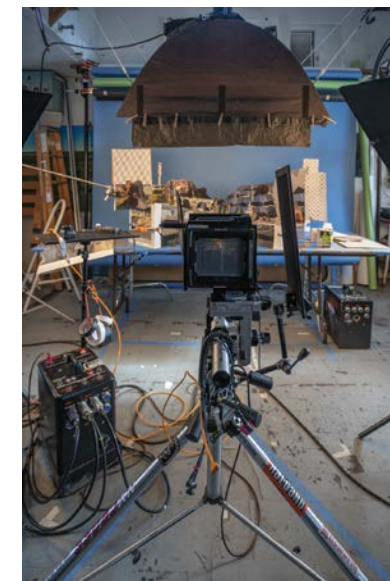
Studio documentation of the making of Tarmac , Reagan Intl. Airport, Washington, DC, 2019