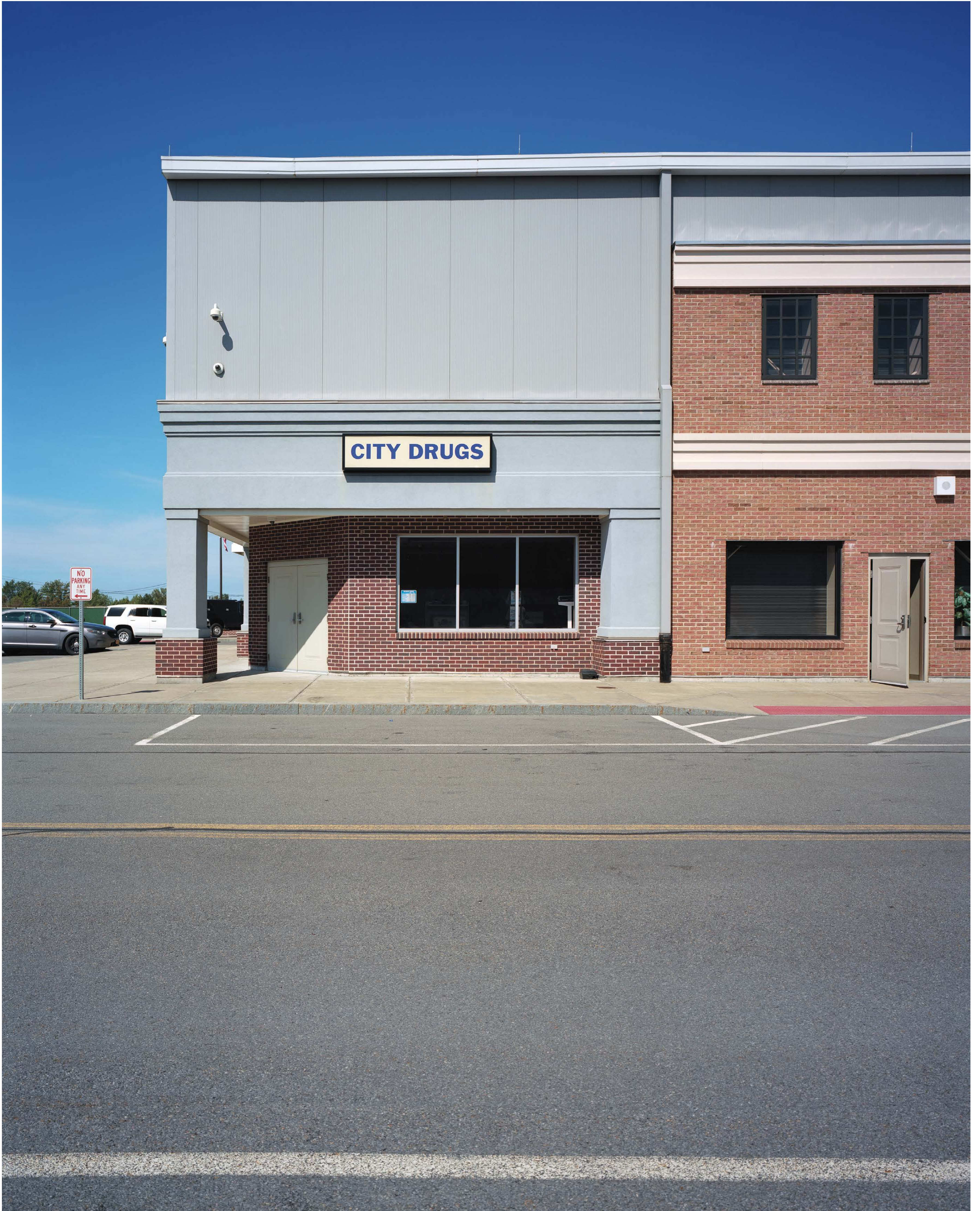
Danny Goodwin, City Drugs , Cityscape Simulator , State Preparedness Training Center , Oriskany, NY , 2019, chromogenic print, edition of 2, 87 x 72 inches